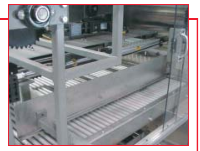
Smooth Servo Drives for Turntable, Product Pusher, and Loader Belt enchance Operation and extra Life of Components

154" X 76" X 58" (3910 mm X 1930 mm X 1470 mm)